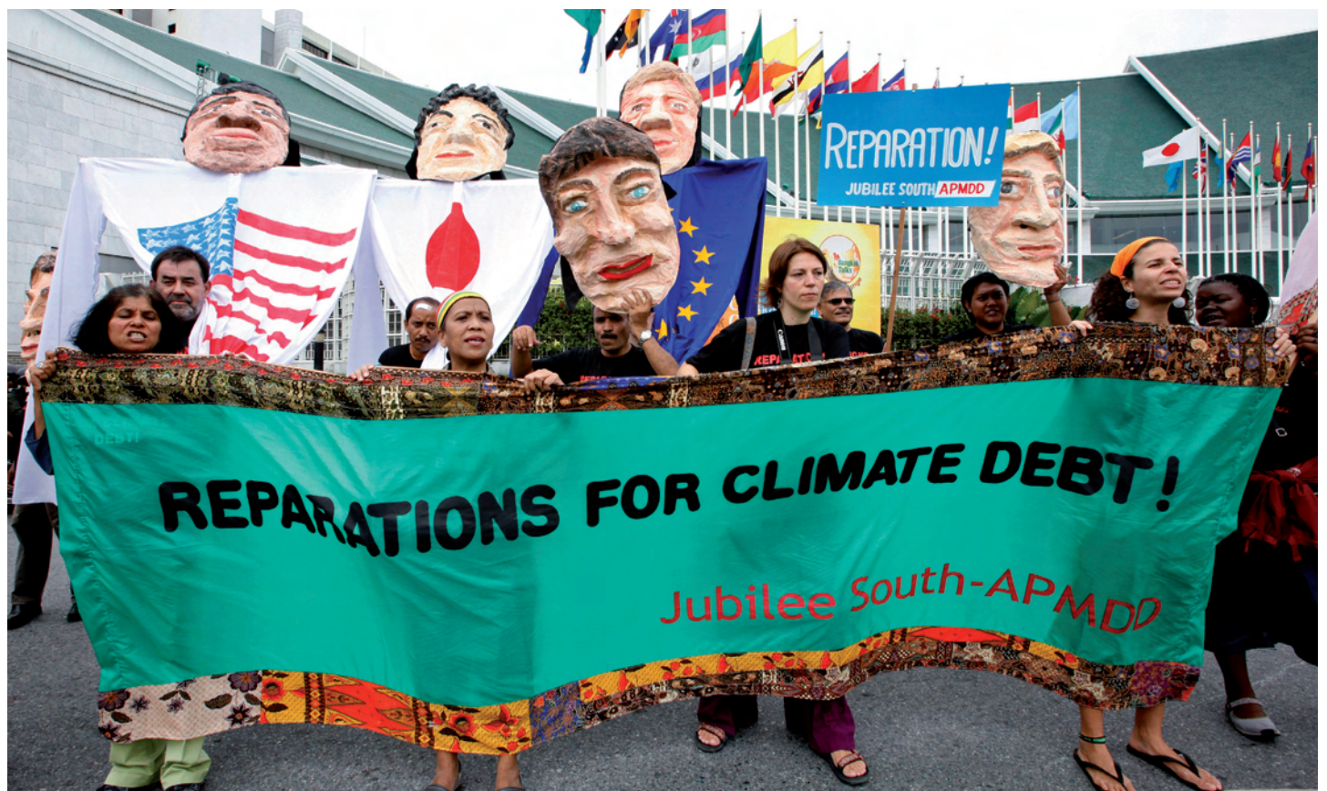
Activists from Jubilee South demand payment of climate debt at the UN climate talks in Bangkok, 2009

Statement from 242 organisations working on climate debt 1